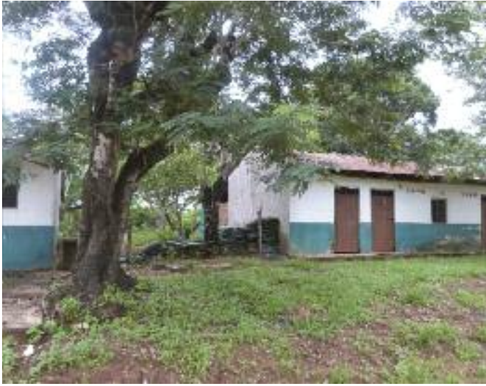
Abandoned police station in El Porvenir