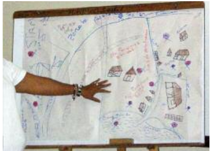
A map of the Playones de Pivijay drawn by women from ASOMUPROCA as part of a social cartography exercise

Meanwhile, the women are still concerned about the debt they incurred from the state to buy the land and