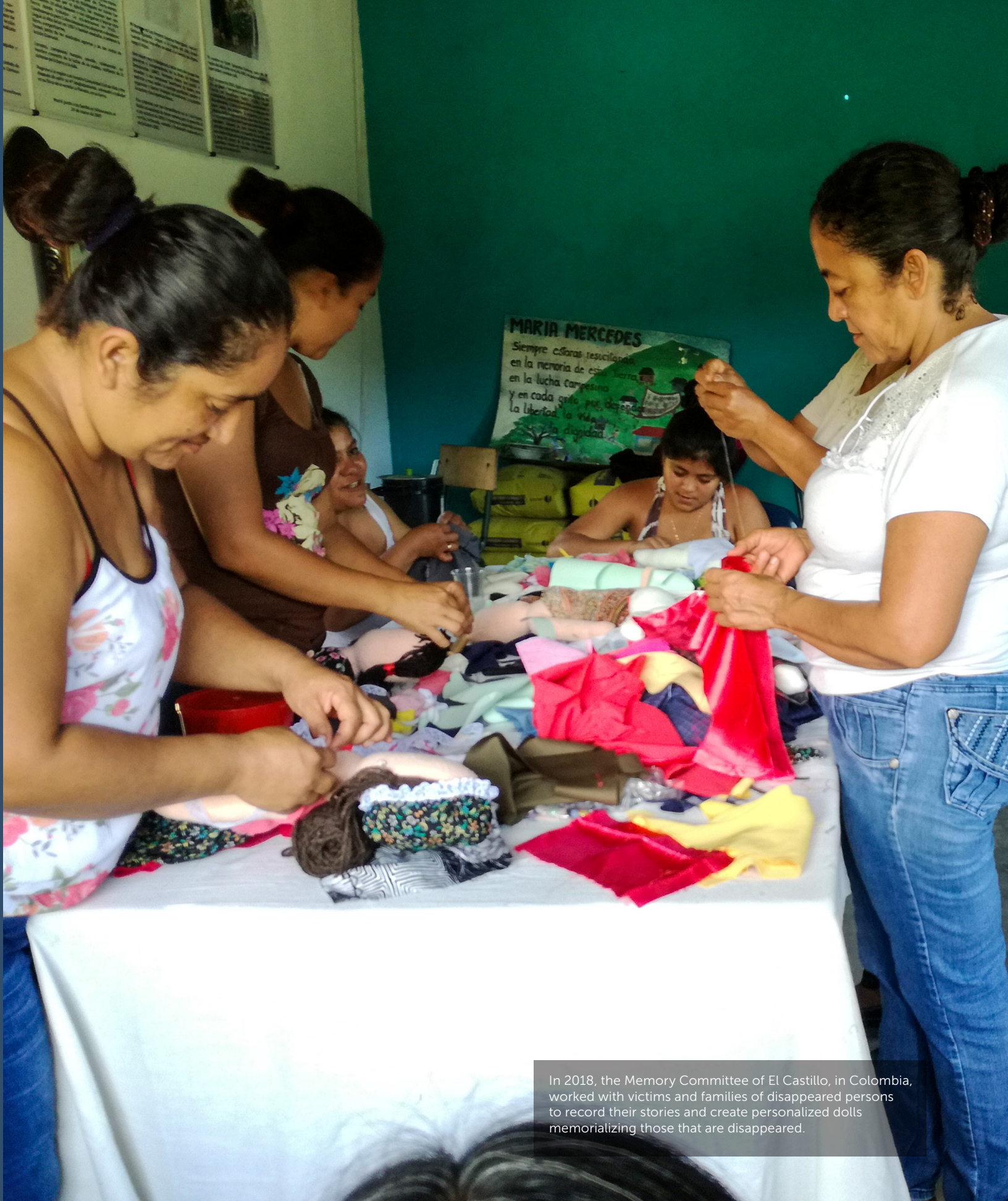
In 2018, the Memory Committee of El Castillo, in Colombia, worked with victims and families of disappeared persons to record their stories and create personalized dolls memorializing those that are disappeared.