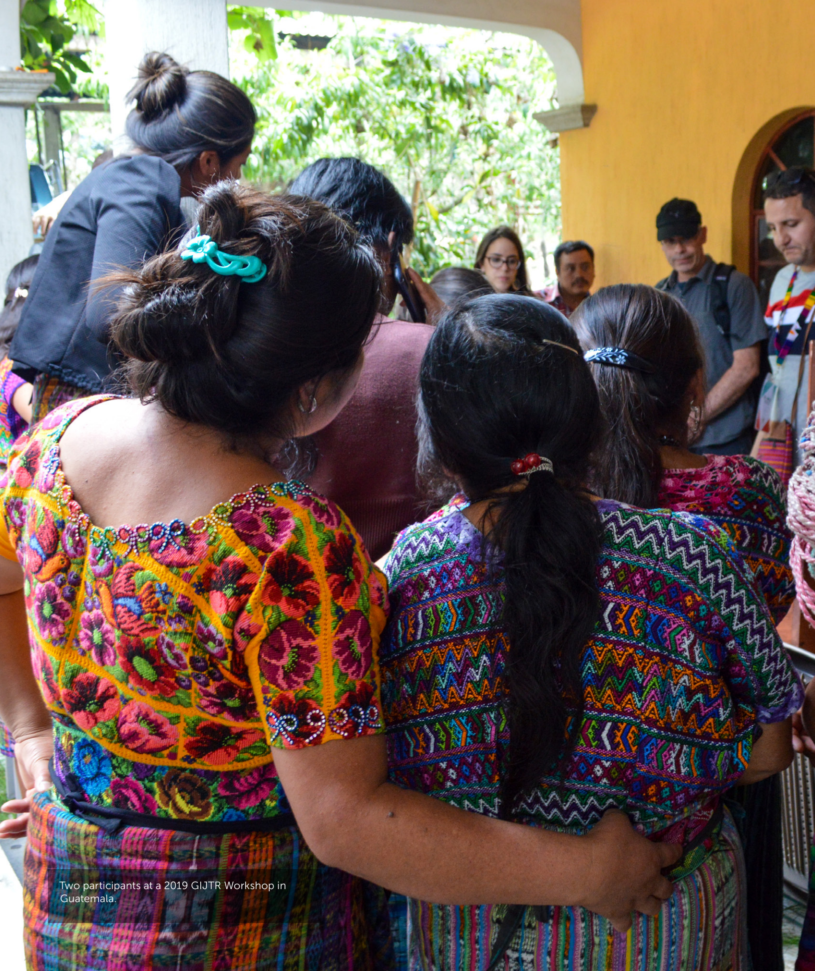
Two participants at a 2019 GIJTR Workshop in Guatemala.