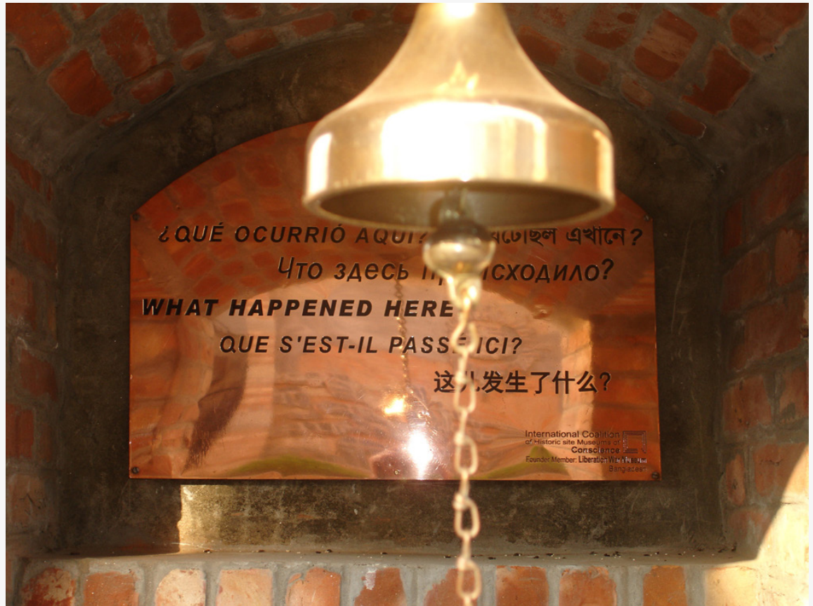
A plaque at a killing site in Bangladesh sponsored by the Liberation War Museum.