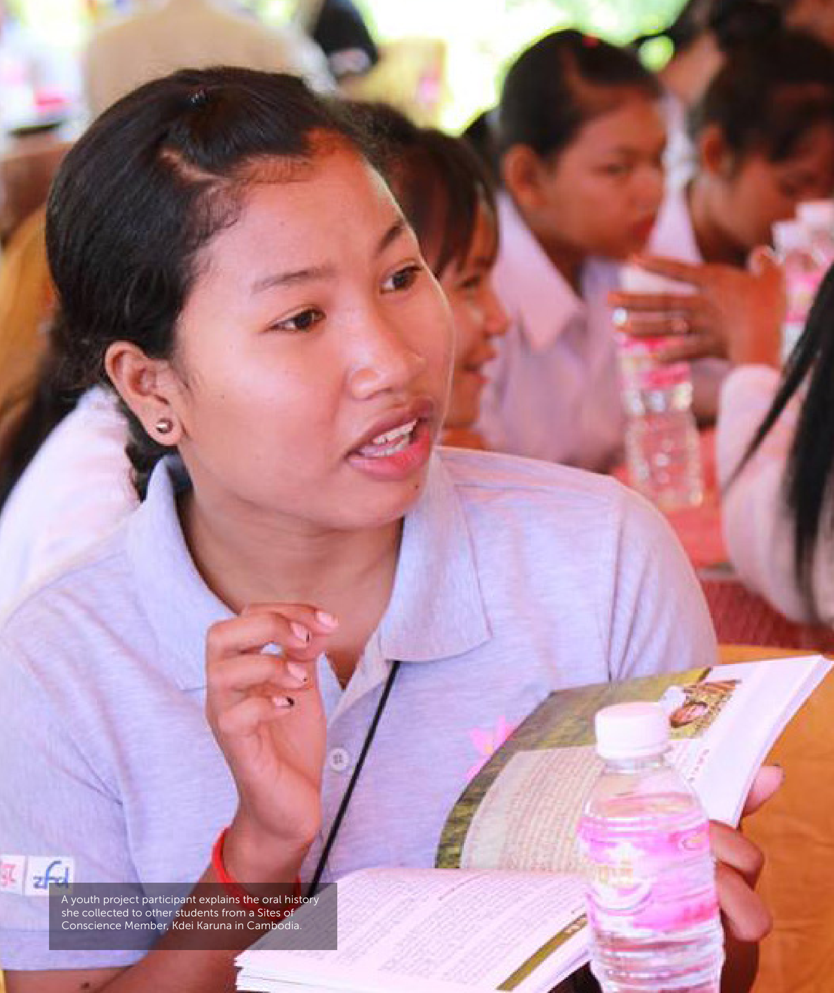
A youth project participant explains the oral history she collected to other students from a Sites of Conscience Member, Kdei Karuna in Cambodia.