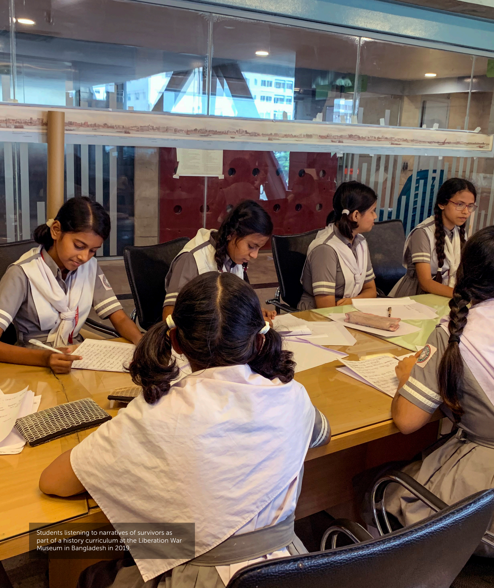
Students listening to narratives of survivors as part of a history curriculum at the Liberation War Museum in Bangladesh in 2019.